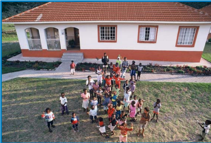
Children at the SOS Children's Village in Lubango, Angola

Children from Benguela and Lubango, Angola have really benefited from the SOS primary and secondary schools in their towns. The schools have really increased the education levels of the local people.